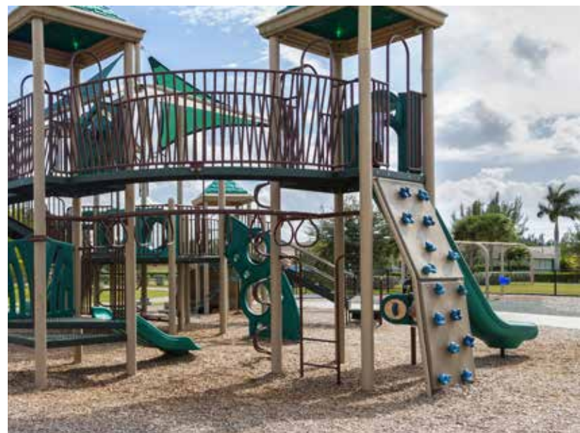
The rate of playground-related injuries at North Carolina childcare centers dropped 22% after a law passed requiring new playground equipment and surfacing in childcare facilities to conform to CPSC guidelines.