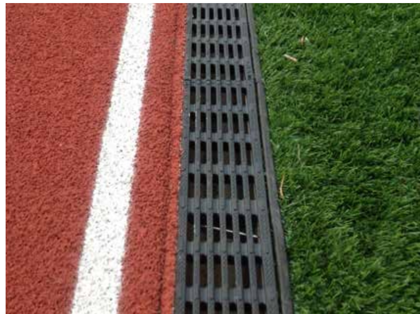
Safety edge channel used to soften the transition from turf to track.