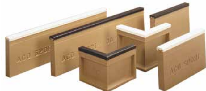
ACO Sport System 7000 safety curbs with cellular rubber capping for jump pits, borders and playgrounds.

ACO Sport offers a number of safety edge products to soften those transition areas. Channels and curbs that offer an integral, cellular rubber cap are proven to minimize the risk and severity of impact injuries.